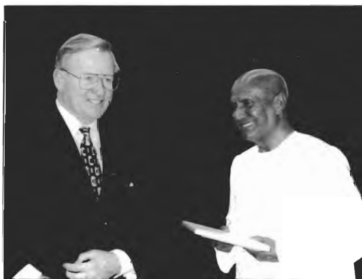
New Zealand Prime Minister Jim Bolger meets with Sri Chinmoy on June 30 in Auckland.

Then, on July 1 in Auckland, the New Zealand Athletics Association gave him The Sports Award, its highest honor, at another Sri Chinmoy Masters track meet, in which he also ran. The award was presented by champion marathon runner Allison Roe.