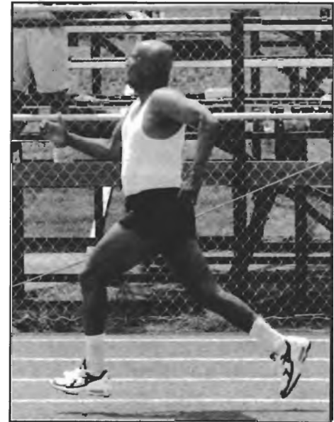
Running the 100 meters at Matawan, N.J.

Later in the day, he offered a short peace concert and meditation at the Jefferson Memorial.