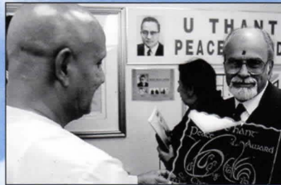
INDIAN PRIME MINISTER I.K. GUJRAL 1997