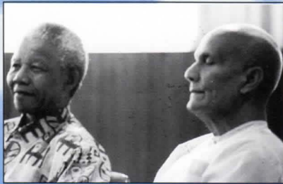
PRESIDENT NELSON MANDELA 1996