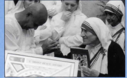
MOTHER TERESA 1994