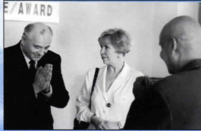
PRESIDENT MIKHAIL GORBACHEV 1994