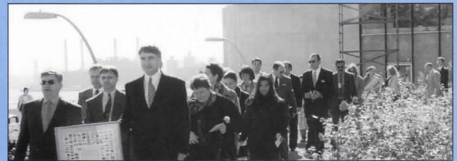
The Preamble of the UN Charter is carried in a nation by nation relay during a Peace Walk in the UN garden.

PEACE RUN FOR THE UNITED NATIONS. Each year the Peace Meditation hosts an 18-mile group run in cooperation with Missions and non-governmental organisations, beginning at the site of the former UN headquarters at Lake Success, New York, and concluding with a brief ceremony at the current headquarters in Manhattan. Runners carry flags of the Member States and the United Nations.