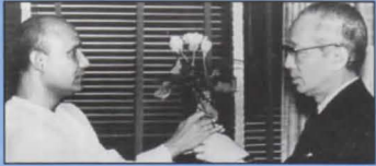
SRI CHINMOY AND THE THIRD SECRETARY-GENERAL, U THANT

In the spring of 1970, at the invitation of then UN Secretary-General U Thant, Sri Chinmoy began leading twice-weekly Peace Meditations at the United Nations for delegates and staff.