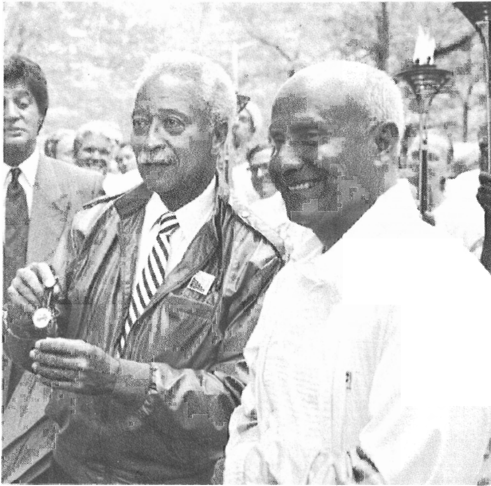
New York Mayor-elect David Dinkins greets Sri Chinmoy at the concluding ceremony for the Peace Run.