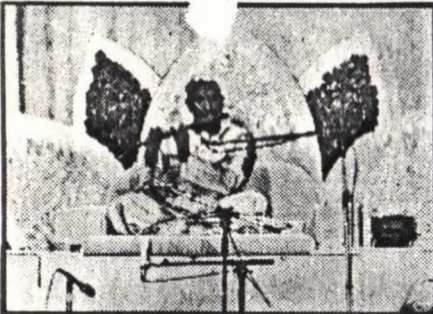
Sri Chinmoy sitzt im Schneidersitz, spielt auf der Querflöte indische Melodien.