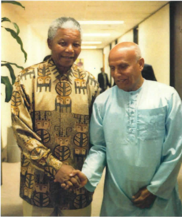
President Mandela and Sri Chinmoy at the headquarters of the African National Congress in Johannesburg, South Africa, on 29 January 1996.

Lyrics of song written by Sri Chinmoy and presented to President Mandela in 1990: