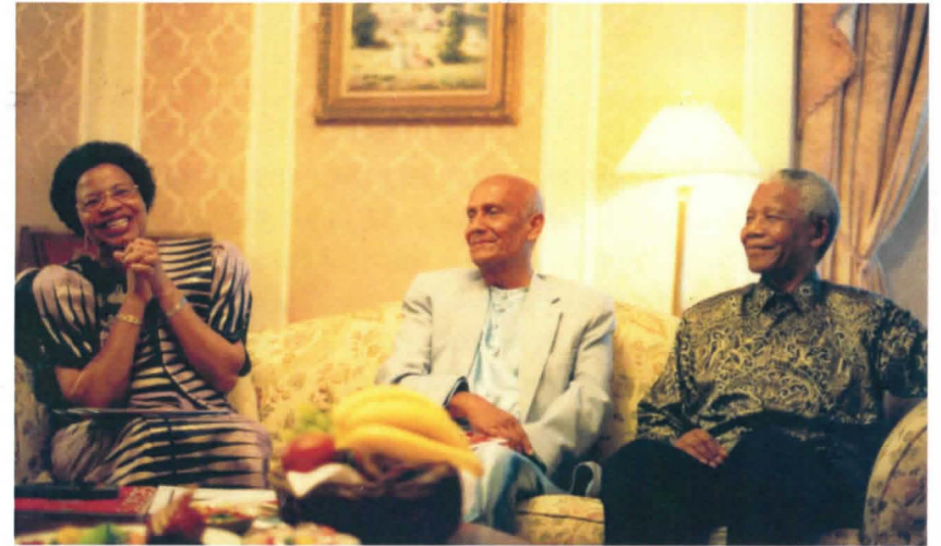
In New York on 20 September 1998, President Mandela, First Lady Graça Machel and Sri Chinmoy share their delight.

"You must vow to turn misfortunes into victory." "Any man that tries to rob me of my dignity will lose." "I am not truly free if I am taking away someone else's freedom." "I dare not linger, for my long walk is not yet ended."