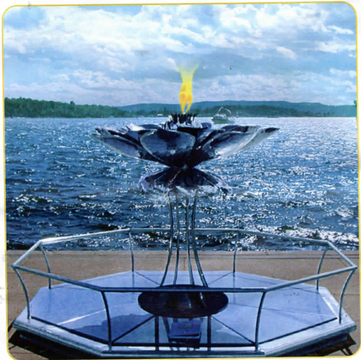
The Eternal Peace Flame Aker Brygge, Oslo Dedicated by Sri Chinmoy, June 9th, 2001