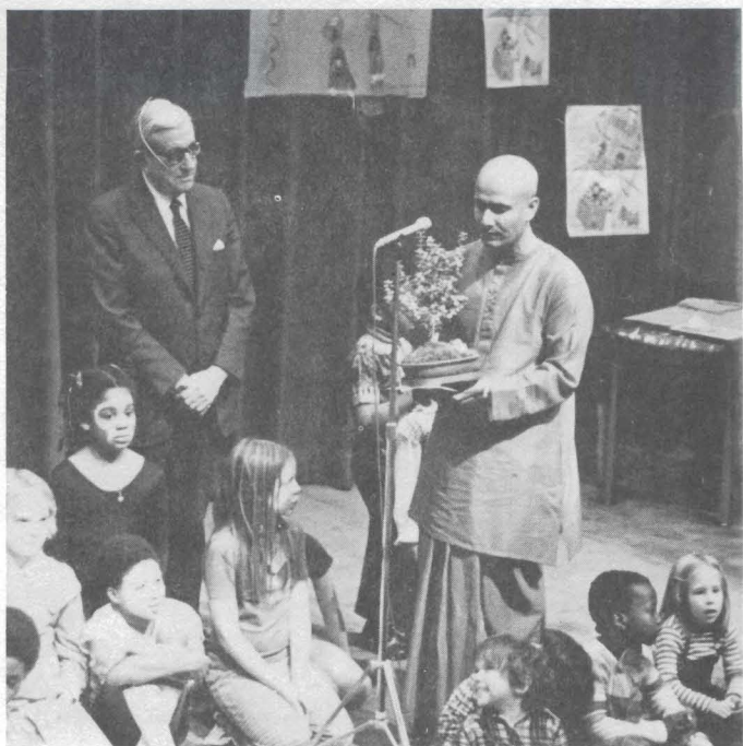
Sri Chinmoy (right) offers presentation to Mr. Henry Labouisse, Executive Director of UNICEF (left)

for your most significant contribution—not only to your country—but to the world at large. As a most distinguished political figure, as a lover of your great country and as a lover of mankind, you have done something that is most illumining. And I am sure that by the infinite Grace of the author of all Good you will be doing infinitely more than what you have been doing for us, your brothers and sisters.