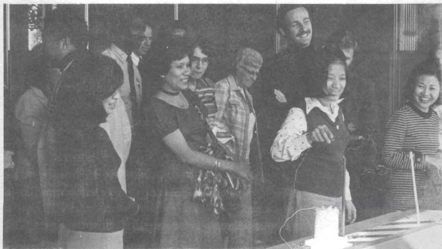
U.N. staff members enjoying side-show entertainment at bazaar sponsored by U.N. Meditation Group