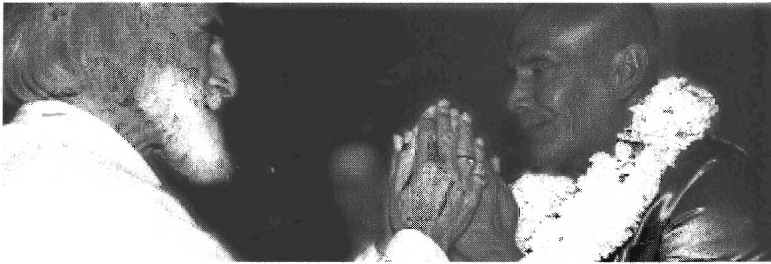
Pir Vilayat Khan garlands Sri Chinmoy at Columbia University, 23 April 1989.

THE GREAT SUFI MASTER PIR VILAYAT INAYAT KHAN, head of the Sufi Order in the West, first met Guru early in 1972, and thirty years later their deep spiritual friendship still endures. Pir Vilāyat has taught the spiritual oneness of religions, at the core of Sufi wisdom, all his life. A pillar of the interfaith movement, he also attended Spiritual Summit Conference V. On the occasion of Guru's 70th birthday, Pir wrote: