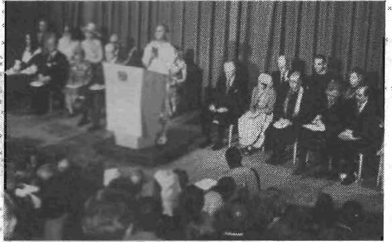
At the United Nations, Guru offers the opening meditation of the Closing Ceremony of Spiritual Summit V. Among the spiritual leaders on the stage, Mother Teresa can be seen on Guru's left in the front row.