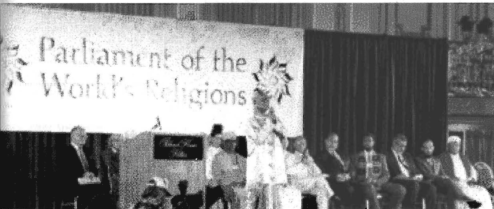
Guru offers the opening meditation in the first plenary of the centenary Parliament of the World's Religions. August 28, 1993.

W ITH THESE IMMORTAL WORDS GURU CAPTURED the essence of interfaith understanding in his own life during his first years in America. To this day, we cherish these words and share them with the world to bring about a profound illumination of the harmony among religions that has been attained through universal oneness.