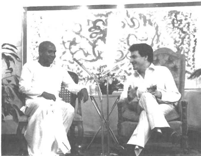
Sri Chinmoy welcomes former Puerto Rican Governor Raphael Hernandez-Colon to the Jharna-Kala Gallery.

(To the members of the Meditation Group present): I feel united with all of you and with Sri Chinmoy in our aspiration. I feel oneness in our souls. I feel that your hearts touch mine and that we are all together traveling on the same path.