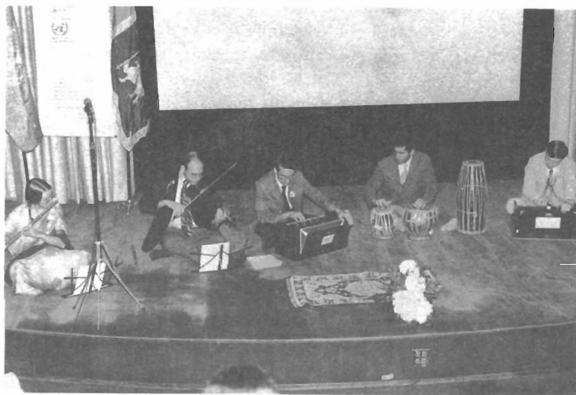
Members of the Meditation Group performing instrumental pieces from Sri Lanka.