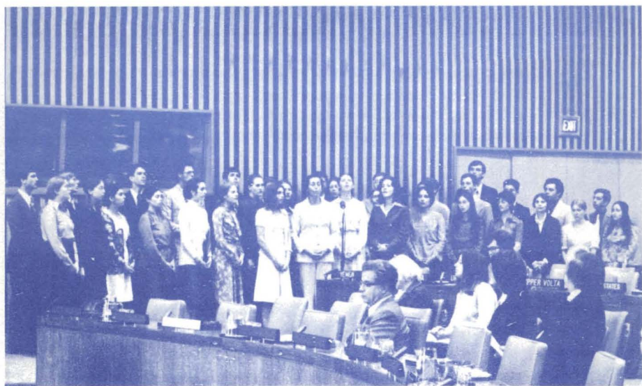
United Nations Meditation Group singing "O United Nations"

"O United Nations" — Song in dedication to the United Nations