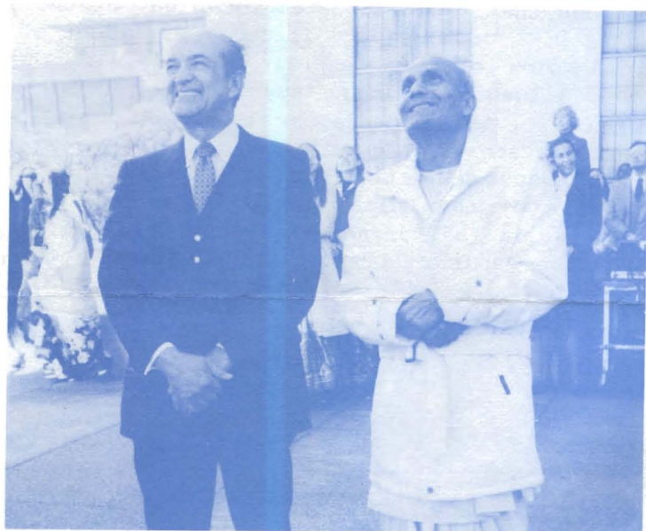
G. A. President Dr. Jorge Illueca and Sri Chinmoy observe UN Day ceremony.