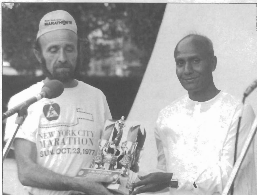
Above: Sri Chinmoy honours Fred Lebow for his contributions to road running during a ceremony held at Lincoln Center on 21 October 1978, the day before the New York City Marathon. Below: Fred receives a trophy honouring the New York Road Runners Club's twenty-five years of service to the running world at a dinner held at Annam Brahma Restaurant on 21 June 1983.