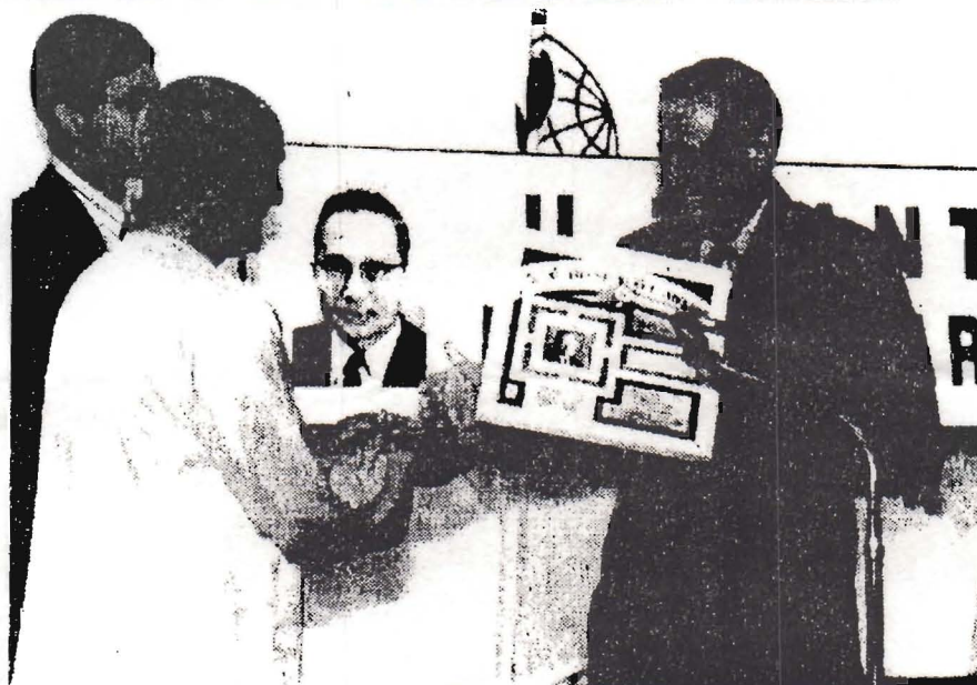
Sri Chinmoy presents U Thant award to James Grant

The prayer, organized by the Peace Medi-