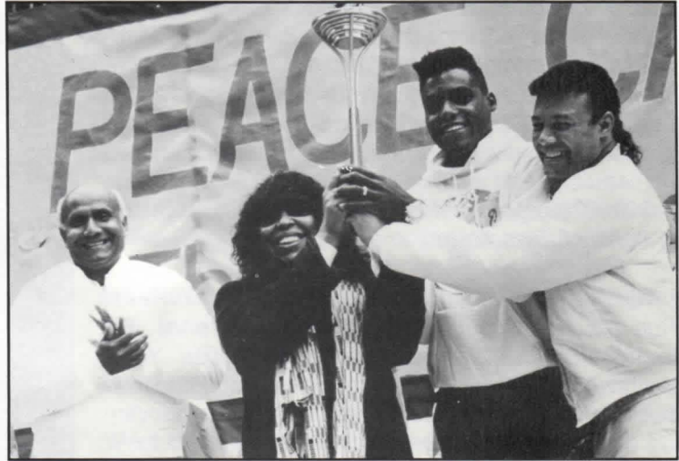
Sri Chinmoy applauds Addwitiya Roberta Flack, Carl Lewis and Narada Michael Walden, who raise the peace torch at the start of the Sri Chinmoy Oneness-Home Peace Run '89.

"Peace Run '89 will do much to inspire us to overcome the barriers to a lasting peace among the peoples of the earth," said Lewis. "Along the way we must pray and we must love. If we put our hands together we can achieve peace."