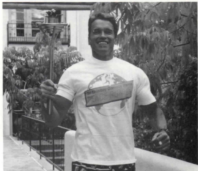
Arnold Schwarzenegger runs for peace.

On June 2, the President of Mexico is scheduled to carry the torch as the Peace Run opens a new highway.