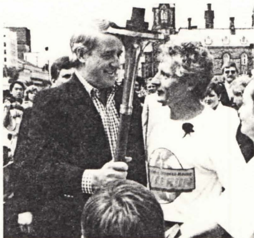
Prime Minister Brian Mulroney passes on the torch during a celebration of Canada's national day.

The Prime Minister of Iceland, Steingruimur Hermansson, and Reykjavik Mayor David Oddsson and representatives of the country's major sports federations open the Iceland relay at the same location where the Reagan and Gorbachev summit meeting took place a few months earlier. The 2,000-mile relay circled the entire island country.