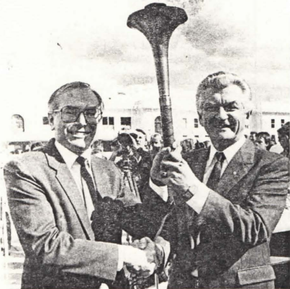
Australian Prime Minister Hawke (right) and Opposition Leader Howard holding peace torch in Canberra.