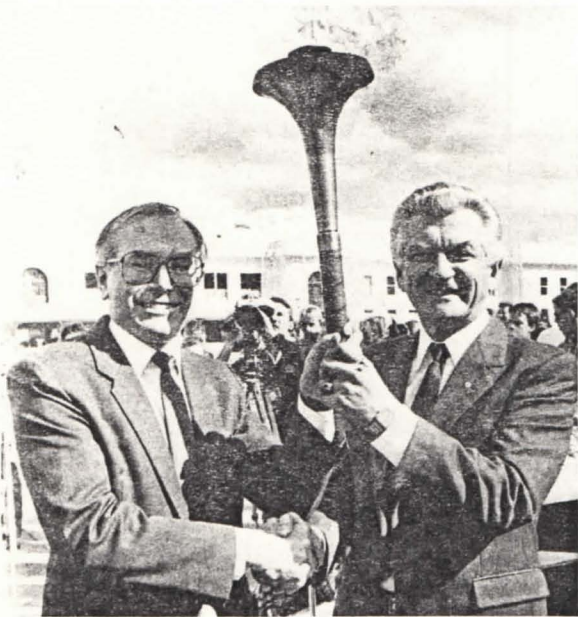
Australian Prime Minister Hawke (right) and Opposition Leader Howard holding peace torch in Canberra.

In a giant cooperative venture, the "Sri Chinmoy Oneness-Home Peace Run" passed seven flaming peace torches from hand to hand among runners in 49 countries with continuous relays spanning the U.S. (11,000 miles through all 50 states), Canada, Europe, Australia and Japan, and local runs held in South America, Mexico, the Caribbean, Africa, Bhutan and China. It was the longest relay run in history, covering a total of over 25,000 miles. The Prime Ministers of Australia, Canada and Iceland, hundreds of other national and local government officials, celebrities and internationally known athletes, as well as AFS exchange students around the world joined thousands of runners and supporters in passing on the message of the Peace Run: "Peace begins one person at a time."