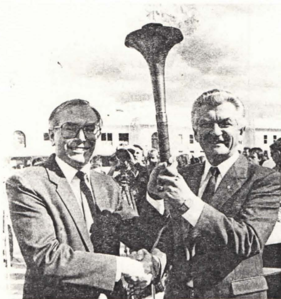
Australian Prime Minister Hawke (right) and Opposition Leader Howard holding peace torch in Canberra.