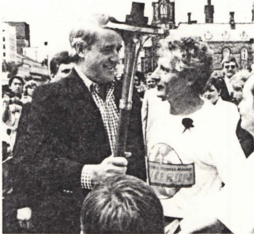
Prime Minister Brian Mulroney passes on the torch during a celebration of Canada's national day.