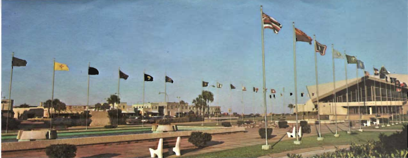
BICENTENNIAL FLAG PAVILION — JACKSONVILLE BEACH, FLORIDA, U.S.A.