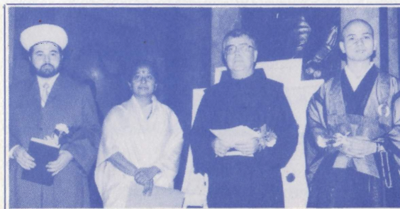
Leaders of various faiths at the State House in Boston after Seven Minutes of World Peace programme in 1984.

Press coverage was extensive in the Netherlands, where there were major articles in the Algemeen Dagblad and the Haagsche Courant . Other articles appeared in various publications in the United States.