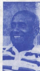
• Sri Chinmoy