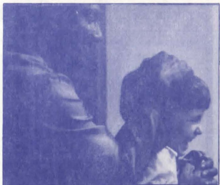
Sri Chinmoy blesses the child of one of his disciples

Sri Chinmoy: Our earthly journey starts with desire, and in the ordinary life we cannot live without it. But if we feel that we are not ready for the spiritual life because we have teeming desires, then I wish to say you will never be ready for the spiritual life. We have to start our journey here and now, even while we are walking along the path of desire. Slowly and unmistakably the Breath of God will come to the fore and transform our desire into aspiration.