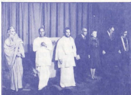
World Day of Prayer United Nations, 1976

Sri Chinmoy: Spirituality has a secret key to open the Door of the Divine. This key is meditation. Meditation simplifies our outer life and energises our inner life. Meditation gives us a natural and spontaneous life. Meditation tells us that our human life is a secret and sacred thing, and it affirms our divine heritage.