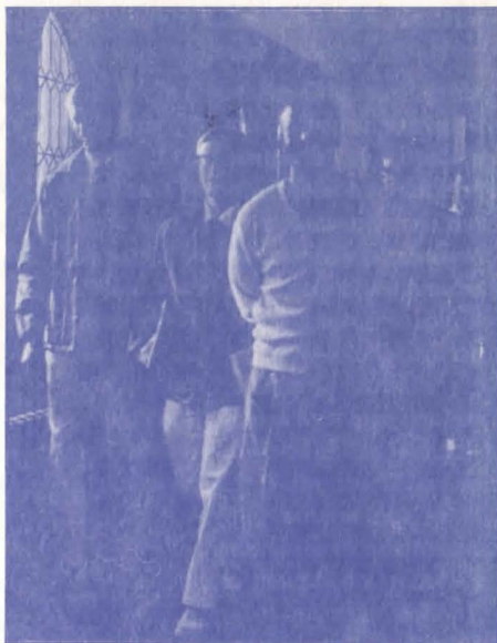
Fifty-state lecture tour Harvard University, 1974

Sri Chinmoy: Outer purity is extremely important. If you keep your outer life clean, then it definitely adds to your inner awareness of Truth, Light and Bliss. The absorption of Light demands absolute sincerity and purity. Spiritual sincerity is constant inner sacrifice and outer sacrifice for the sake of self-perfection. Real inner purity is the constant remembrance of the Supreme, who is our Eternal Pilot. Purity is the vessel inside which we hold Peace, Light and Bliss from above.