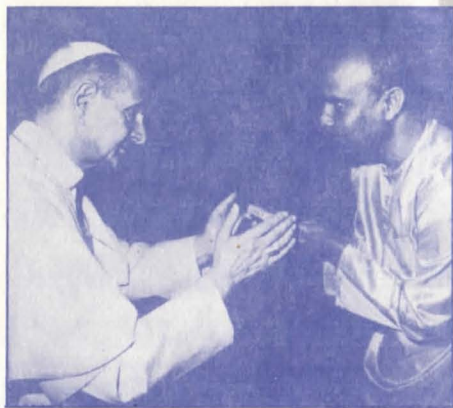
Receiving Papal Medallion from Pope Paul VI

Sri Chinmoy: There is quite a difference between inner emptiness and barrenness. What you mean is barrenness—the barrenness of your mental, vital and physical life. Barrenness can be got rid of only by a constant inner cry. You need a higher life, a better life, something that will really satisfy you. This need is not desire; it is the longing to do something good and become something divine to please God in God's own way.