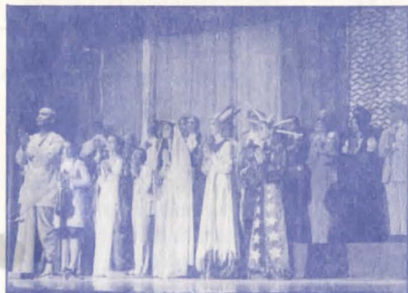
With original cast of The Sacred Fire (Sri Chinmoy's play dedicated to America)

Sri Chinmoy: How we utilise the material life is what is of paramount importance. Matter, as such, has not done anything wrong to God; it is not anti-divine. It is we who use material things in the wrong way. We must enter into the material life with our soul's light. We have to feel that matter and spirit go together. Matter has to be the conscious expression of spirit. The material life has to be moulded and guided by the spirit. If the material life means expansion—the expansion of the heart, the expansion of love, rather than only of externals—then matter and spirit can easily go together.