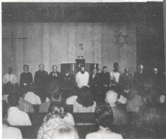
Silent Prayer—Religious Representatives with Director, U.N. Meditation Group