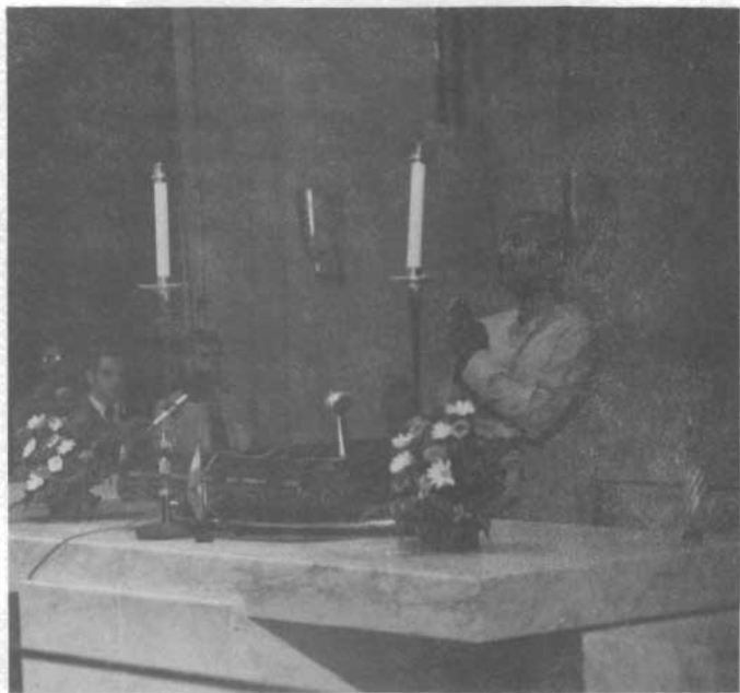
Opening— Silent Prayer— Sri Chinmoy Director, U.N. Meditation Group