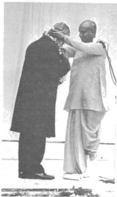
Sri Chinmoy garlands U Thant