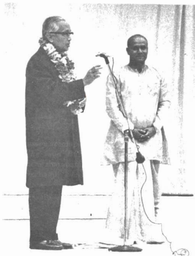
U Thant replies to Sri Chinmoy's speech of welcome