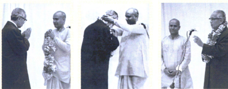
Sri Chinmoy garlands U Thant (left and centre). U Thant offers his soul-stirring reply following Sri Chinmoy's speech of welcome (right).

"Sri Chinmoy in his play also has drawn a very vivid picture of the identity between God and Truth, soul and inner Light, which I very much hope will create an abiding interest in these two great religions—Hinduism and Buddhism—which in many ways constitute the key to all great religions. I feel very strongly, as some of my friends know, that only by the practical application of the teachings of great religious leaders, particularly the development of the moral and the spiritual aspects of life as Sri Chinmoy has stressed in the play—love, compassion, tolerance, and the philosophy of live-and-let-live, modesty and even humility—that only with this approach, only with this method, will we all be able to fashion the kind of society we want, a truly moral society, a decent society, a livable society, which is the goal of all great religions.