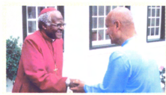
Residence of the Archbishop of Cape Town Cape Town, South Africa December 20th, 1995

Sri Chinmoy: “Archbishop Desmond Tutu, Father Tutu, your life of unswerving faith represents the enduring love of the Divine for your cherished country—a land richly blessed by the Creator yet, for so long, torn by the strife of separation. Throughout long decades of struggle, yours was the eloquent voice of unity, of reconciliation, of tolerance, of patience, of forgiveness and of conviction. At the same time, it was a compelling call to action. Finally, your voice proclaimed the destined victory of justice, peace and oneness.