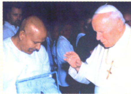
Sala Clementina, The Vatican May 17th, 1998

On the eve of Pope John Paul II's 78th birthday, Sri Chinmoy prayerfully offered the U Thant Peace Award to the Holy Father on behalf of himself and the Peace Meditation at the United Nations. The Pope was deeply moved and affectionately placed his hand on Sri Chinmoy's left hand. He lovingly and compassionately blessed the award three times with his hand. This was Sri Chinmoy's fifth of six audiences with Pope John Paul II.