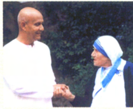
Missionaries of Charity House adjoining the Church of San Gregorio Rome, Italy, October 1st, 1994

Sri Chinmoy: "You are the Mother of Compassion. You are the Sister of Affection. You have conquered the hearts of all the poor and needy people you have served. You have not only conquered them, but you have conquered India. Not only India, but the entire world. The entire world has boundless gratitude to you. You have elevated the consciousness of the entire world."