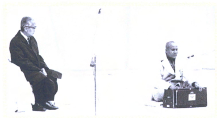
Secretary-General U Thant listens attentively as Sri Chinmoy sings a song about the Buddha, " Buddham Saranam Gacchami ," which he set to music for the occasion and performed, accompanying himself on the harmonium, before the premiere of Siddhartha Becomes the Buddha on May 25 th , 1973.