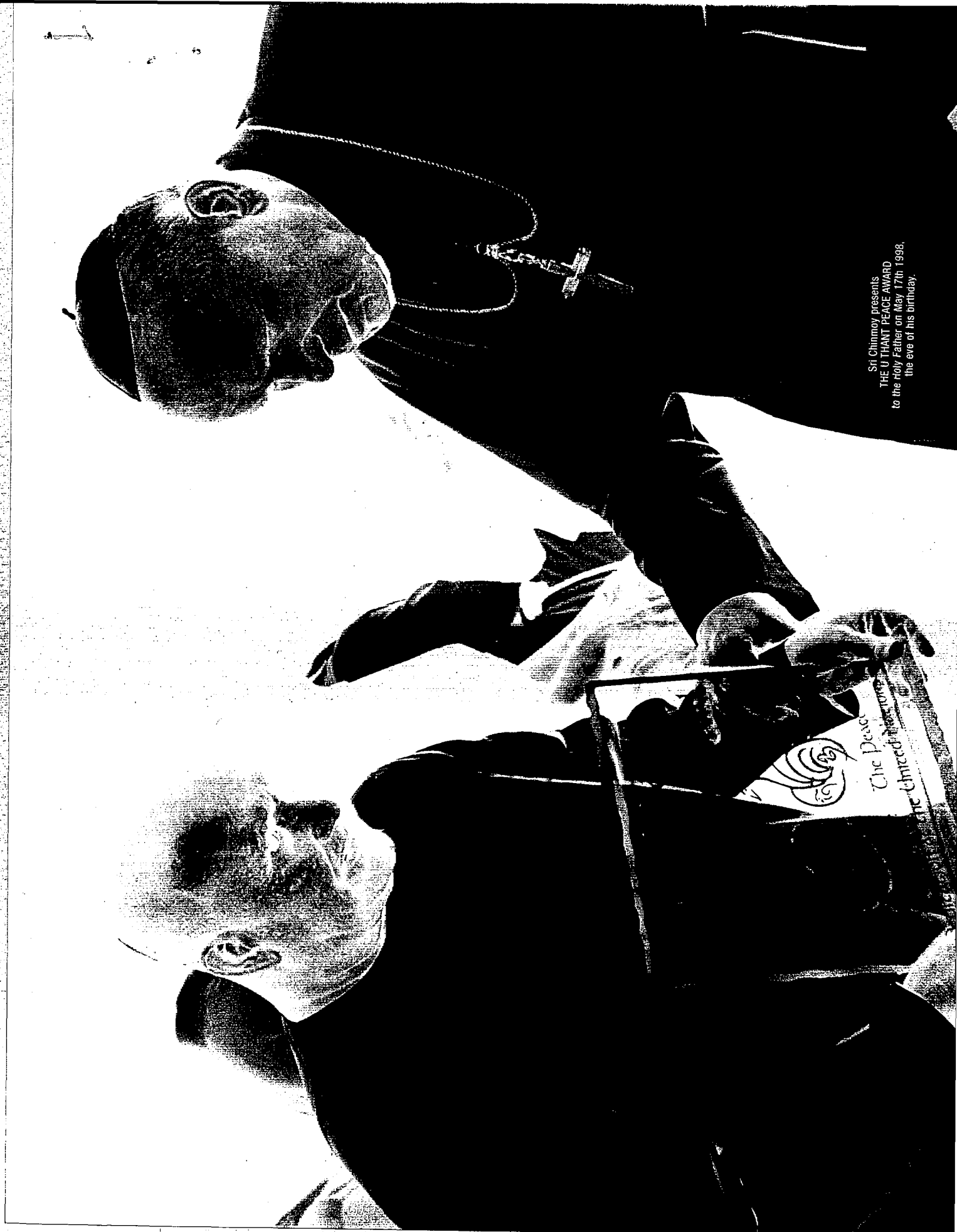
Sri Chinmoy presents THE U THANT PEACE AWARD to the Holy Father on May 17th 1998, the eve of his birthday.