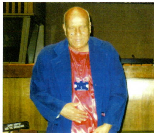
Guru after a meditation in one of the UN conference rooms in 2005. Guru is wearing his UN pass around his neck.

Guru's way is the safest way I know of, because it is everlasting. It is extremely, extremely powerful to have Guru. I end with one big word: gratitude, gratitude, gratitude. Guru was a big catalyst in my life.