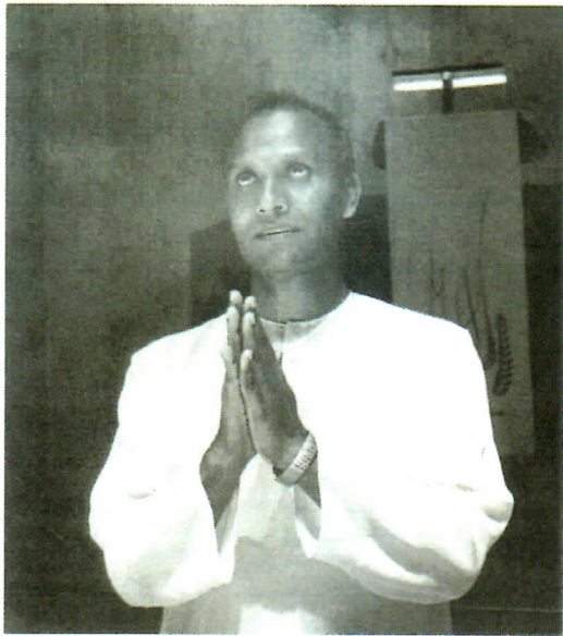
Guru conducts a Peace Meditation at the Chapel of the Church Centre for the United Nations, Sep 1971.