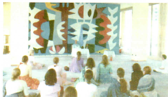
Guru meditates in the UN's Dag Hammarskjöld Library Penthouse, with a wall of ceiling-high windows on either side. The windows at right are the ones visible in the photograph of President Kennedy.