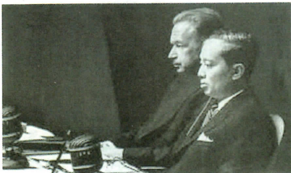
This photograph was taken in the General Assembly Hall in 1959, two years before U Thant (right) became UN Secretary-General upon the death of Dag Hammarskjöld (left).

I had the occasion to pass very near U Thant in a narrow corridor. It was a very special occasion. I think the President of France was coming, and U Thant was sitting in the narrow corridor where people congregated when their President was coming to the United Nations. We UN Singers had to pass by U Thant and then sing in the back of that room. When I passed by U Thant in that narrow space, I felt a circle of power all around him. It was very evident that he was a special person.